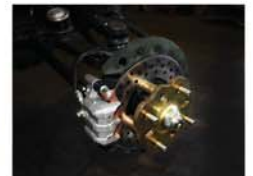
Front & Rear Disc Brake Hydraulic disc brake pump