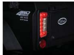
LED Tail Lights Brand New Style Tail lights