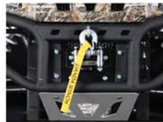
Front Electric Winch 2,500 lbs. Capacity