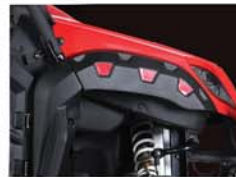
Wheel Fender Flares Front and Rear Wheel Fender Flares