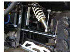
Independent Suspension Front & Rear Independent suspension with double A-arms and brush guards