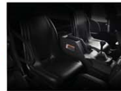
Adjustable Seats Comfortable bucket seats