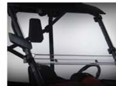
Double Windshield With Ability to remove the lower or upper section