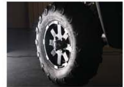
Aluminum Alloy Rims with Kingstone® All-terrain Tyres