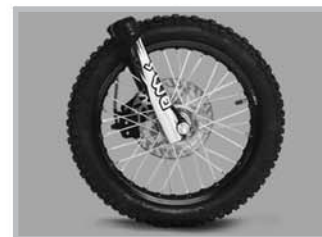
Steel Rims Front & Rear Black Painted Rims