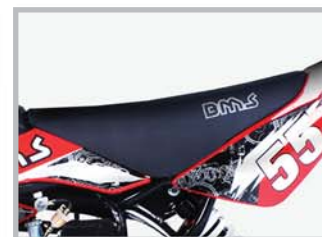
Comfortable Foam Seat Quality seat cover with improved grip