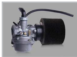
AIR INTAKE 16mm Carburetor with Racing Air Filter