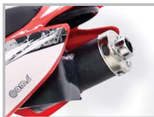
Performance Exhaust High Performance Muffler