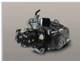
Powerful Engine Semi-automatic