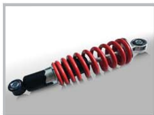
Rear Suspension High Performance Spring shock